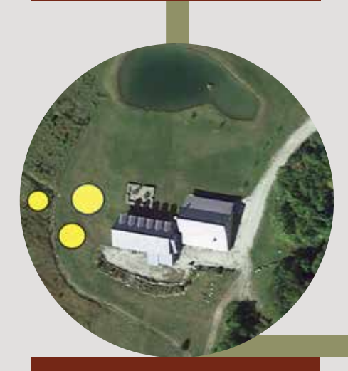
Satelite image showing placement of three meditation halls